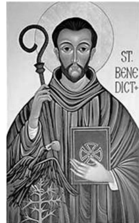
St Benedict of Nursia

All Most gracious and Holy Father, give us wisdom to perceive you; diligence to seek you; patience to wait for you; eyes to behold you; a heart to meditate on you, and a life to proclaim you. Through the power of the Spirit of Jesus Christ Our Lord. Amen.