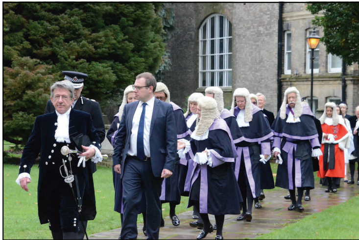
Over 600 people attended the Justice Service on 13th October to mark the start of the legal year.