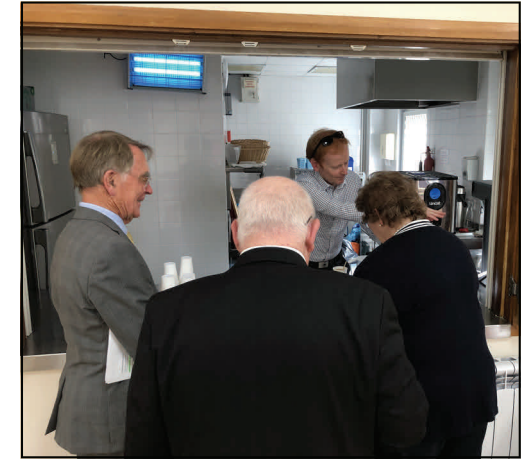
Grabbing a short break between services