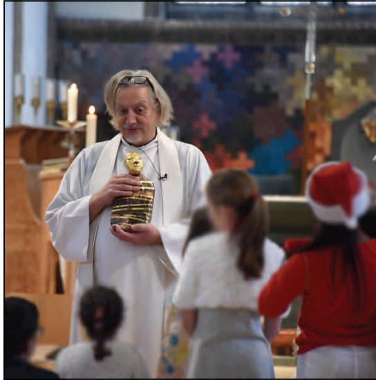
The children made a search for Jesus at the 9.30am