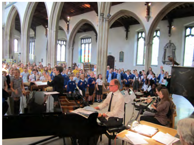
A 'Great Big Sing'

Role play, using the senses, looking and searching, sketching, listening to stories of and about Jesus, creative practical activities, group discussion, reflection and music.