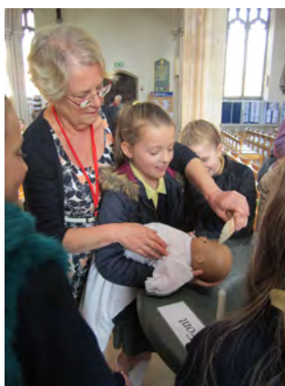
Baptism is re-enacted