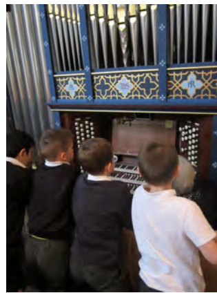
An organ demonstration