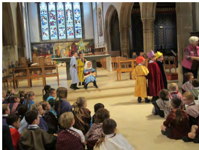
Workshops will often include drama and costume.