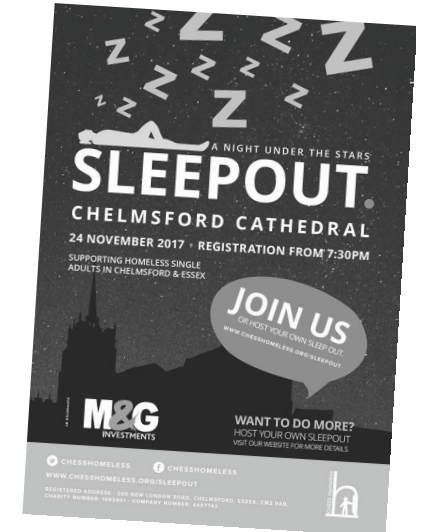
CHES hold a sleepout at the Cathedral each Autumn