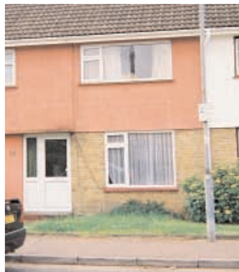
The new house