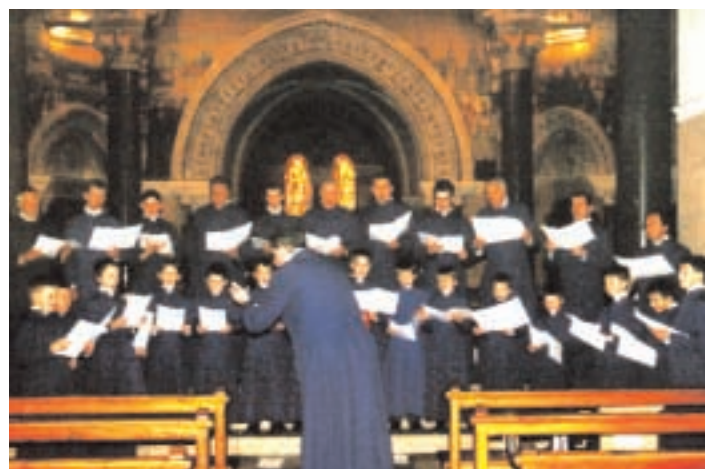
Rehearsing for a concert in Annonay