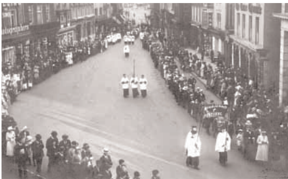
The earliest photograph we have shows the Cathedral and Choir in procession in the High Street (1922)