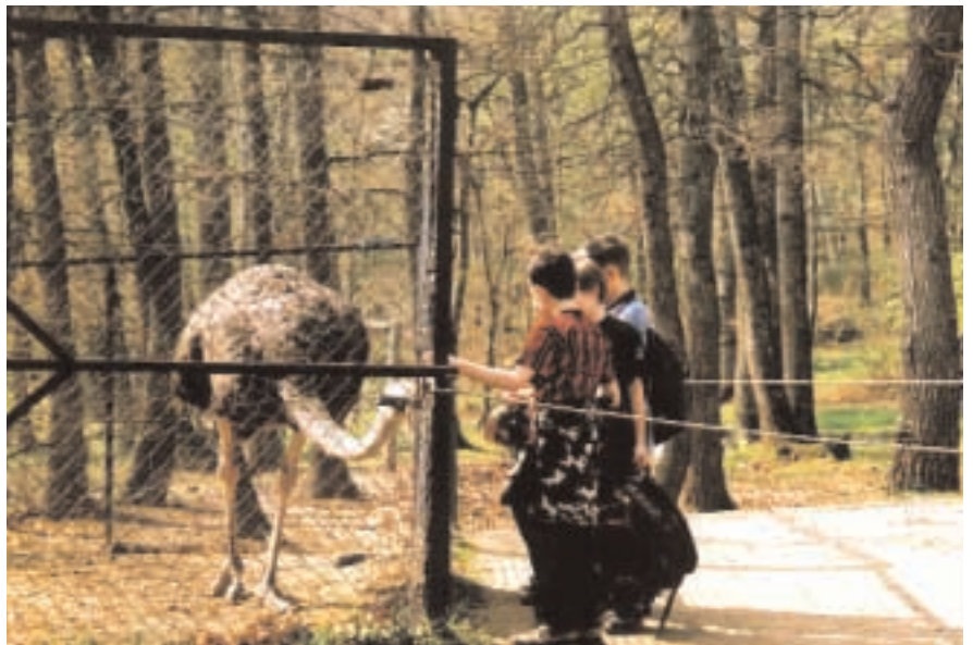
Some boys at the Safari Park.

We were all happy today, as this was our free day. We all thought that we were going swimming, until my Dad said we were walking up the nearest hill. He said that we were going to catch "the famous Annonay bear", but I think that was just a con to get us walking. I personally enjoyed it more than I would have done swimming. We named the hill C, P and M (choir, parents and Matron). We got back in time for lunch, which was followed by a trip to the local safari park. We all enjoyed this trip, especially the part where we drove around in the coach, and came literally metres from bears and ostriches. We had dinner, followed by a Quiz, which I think we all enjoyed.