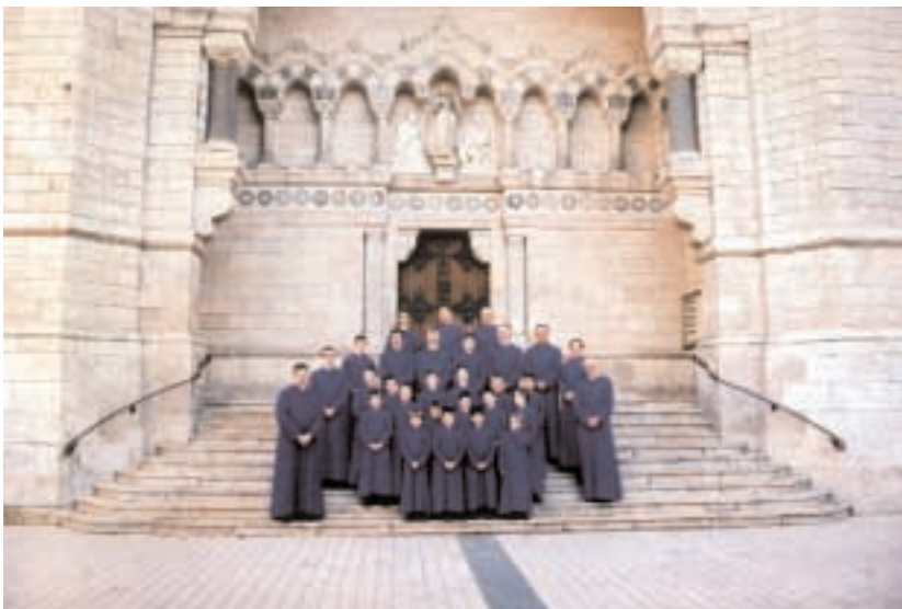
The Choir at the Basilica, La Louvesc (Thursday's Concert).