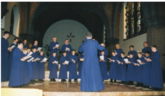
Concert in monastery at Leuven