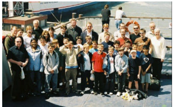
On the Ferry to Antwerp