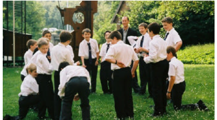
Playtime outside the Monastery

We all met outside Shire Hall. We travelled by coach to Dover, and after a short delay by ferry to Calais. The journey was uneventful. With a bit of luck we found our lodgings. There were several blocks of flats, and all the boys were in block C. The rooms were very simple and shared between two. After the first night some of us had been bitten by mosquitoes. The food was very nice-except the spinach soup! On the second day, after breakfast, we had a full choir practice in the chapel, and after lunch we were taken swimming, which was great. In the evening the men gave a recital whilst we had a 'quiet time'.